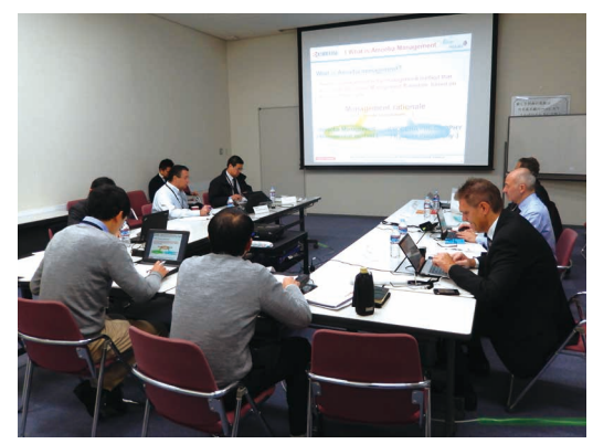
Training in Kyocera Philosophy is provided worldwide

This CSR Summary Report 2015 from KYOCERA Document Solutions provides a general overview of our CSR activities in FY2014. Topics covered include activity highlights, efforts to make products more environment-conscious, global environmental efforts, and efforts by our plants to create products with outstanding environmental performance.