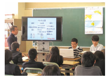
Class by trainees

spoke in Japanese to students from the Shijonawate Junior High School about the Vietnamese language, sweets, games and other topics. This was a fun opportunity for cultural exchange, for both the students and the trainees.